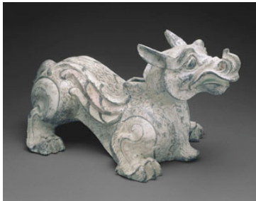
Chimera from the collection of the Art Institute of Chicago